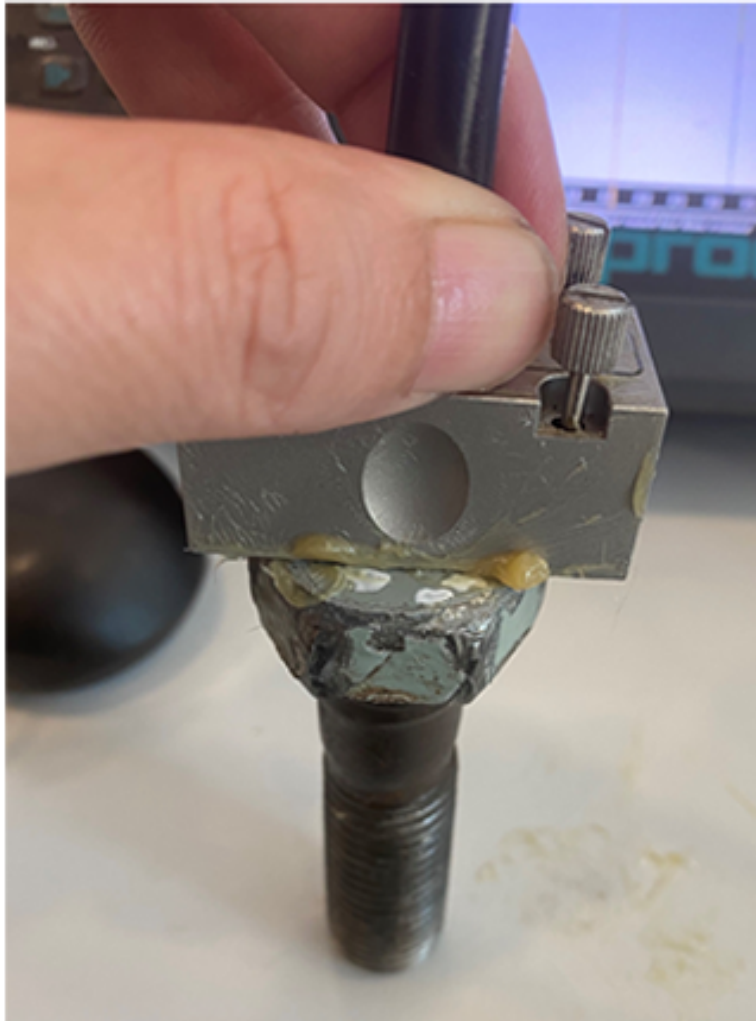
Phased array probe being held on a bolt. The bolt is ex-situ for the 'proof of concept' project but an identical testing method can be used with the bolt in-situ

To test out the proposed solution, a defect was simulated using a 2 mm cut, just beneath the bolt head. Phased array testing was used to get images from the two bolts - one with no cuts and one with the 2mm cut. In the images, the bolt threads and base of the bolt can be identified. And in the bolt with the 2mm cut, an additional indication is visible from the 2mm cut. Further tests were conducted and it was concluded that ultrasonic array technology is a suitable approach for testing and sentencing bolts on-site.