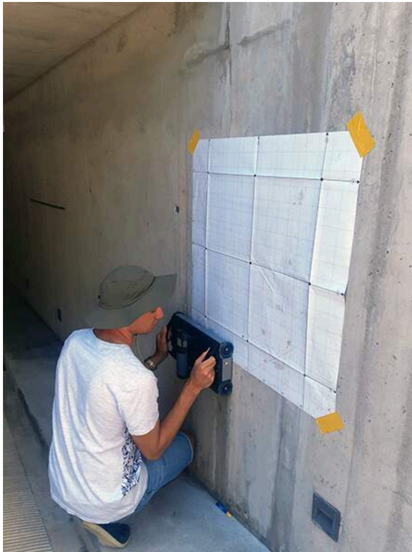
Using the GP8100 to collect an area scan