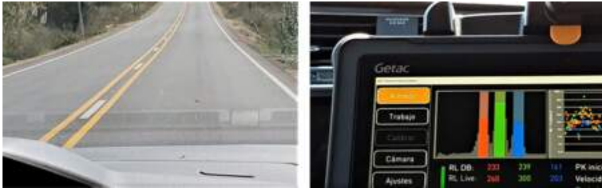
Example of a road with triple road markings (left) and the results as seen live on ZDR6020 software (right).

Zehntner ZDR6020 is able to measure the retroreflectivity of three lines simultaneously. This is important for airports since such line patterns are common.