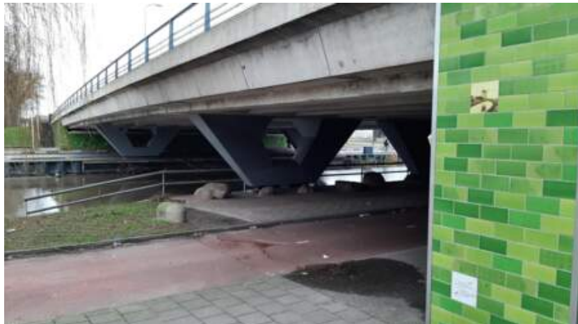
Side view of the bridge and drawings with indications of GPR data collection

The municipality of Utrecht wanted to redesign a road containing a small bridge, where some light poles had to be moved. Screening Eagle's customer, Ten Thije, was contracted to check whether the new locations for the light poles contained prestressing reinforcement.