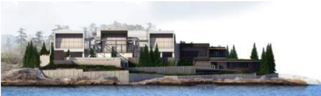
Image source: https://www.hdrinc.com/ca/portfolio/mcloughlin-point-wastewater-treatment-plant

As one of John's bigger sites, he took about 30 minutes prior to the inspection to set up his inspection report template, uploading seven drawings into the 2D view in Inspect, and customizing the data fields he was going to need to collect when onsite.