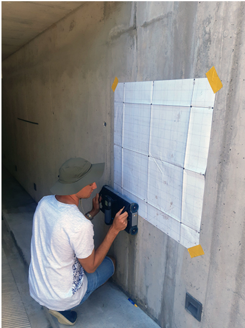
Using the GP8100 to collect an area scan