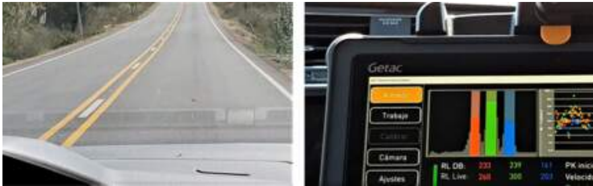
Example of a road with triple road markings (left) and the results as seen live on ZDR6020 software (right).

Zehntner ZDR6020 is able to measure the retroreflectivity of three lines simultaneously. This is important for airports since such line patterns are common.