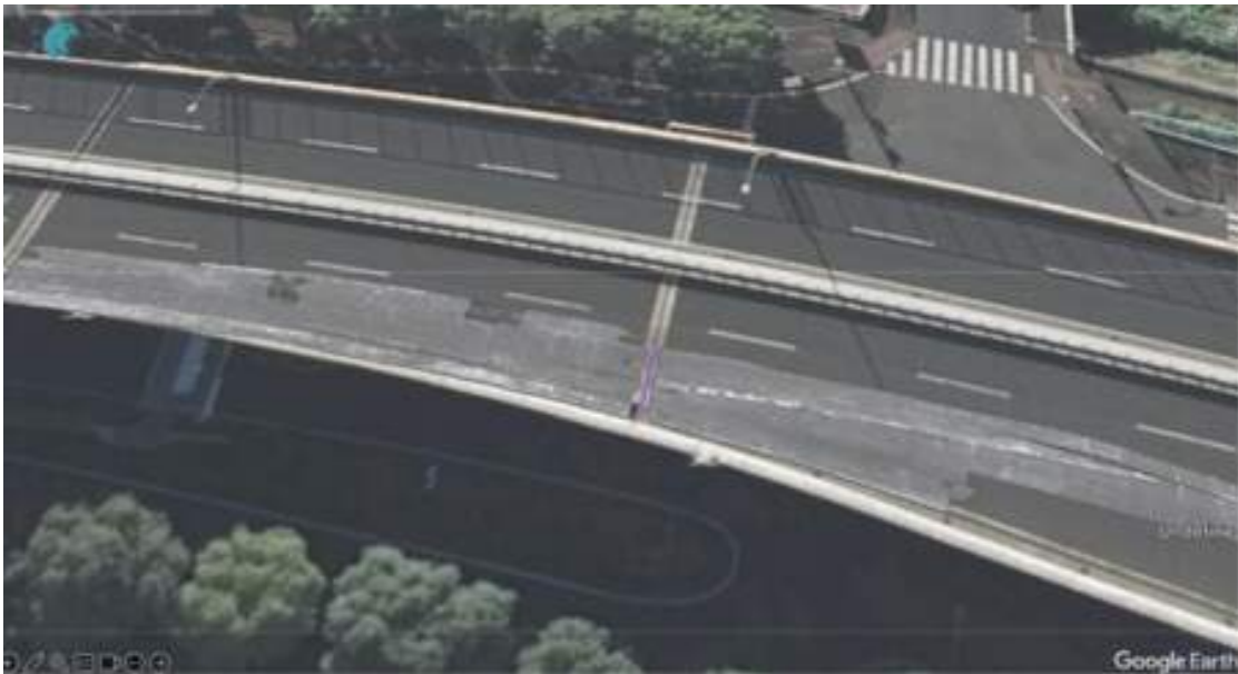
Figure 1. C-scan view overlaid in Google Earth, depicting the analysis of surface defects obtained from GPR Insights data collected by the GS9000.

In the realm of Ground Penetrating Radar (GPR) technology, the prevailing design convention typically entails utilizing a spacing of approximately 7.5 cm between channels. This standardization persists across varying configurations, encompassing diverse frequency ranges and channel allocations. However, such a conventional setup often encounters limitations in effectively detecting surface defects such as cracks and deterioration defects in asphalt/concrete (A/C) layers.