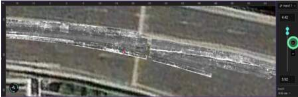
Figure 6. Extended surface layer defects were found at depths of 4 to 6 cm within the asphalt layer.