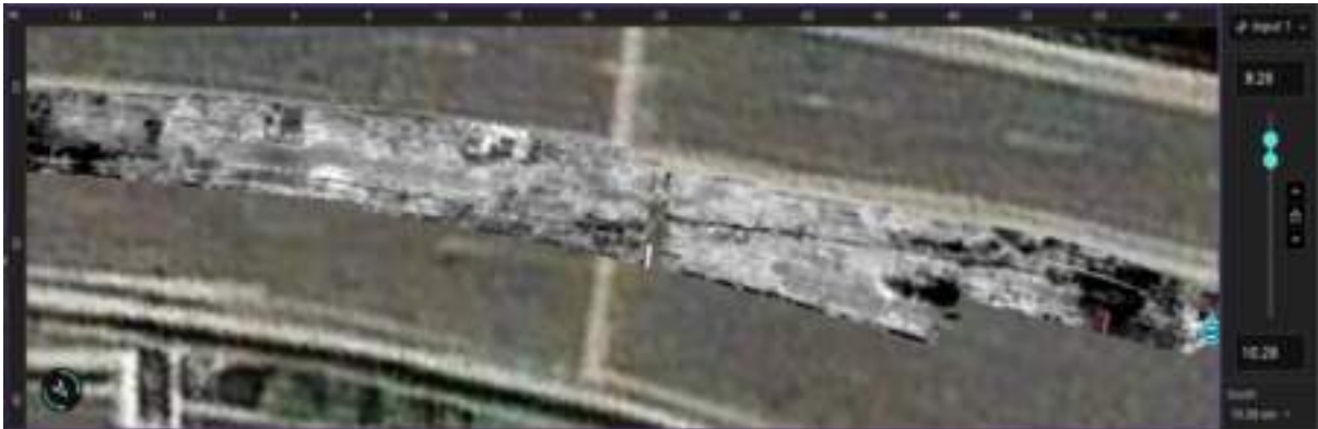
Figure 7. Interface defects between Asphalt-to-Concrete (A/C) layers (Delamination.)