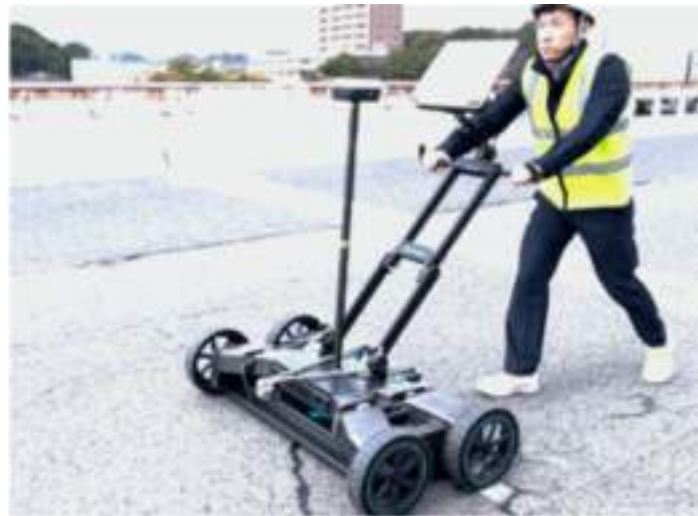
Figure 2 and Figure 3 show the GS9000 system operating on the bridge deck