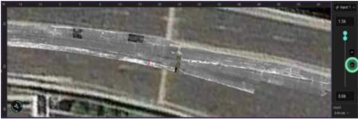
Figure 5. Major surface defects at asphalt layer (cracks)