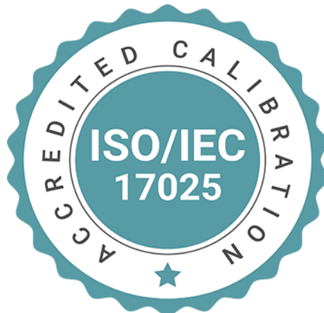
ISO/IEC 17025 accreditation

The release of the world's first Portable Hardness Testing book in 2022 was a significant milestone in the field of portable hardness testing. The book covers various testing methods and provides valuable insights into how to use portable hardness testers effectively, avoid errors, solve hardness-testing-related problems and use best practices, making it a valuable resource for beginners and experienced professionals alike. The release of this book contributed to the standardization and improvement of portable hardness testing and provided a reference for the entire market.