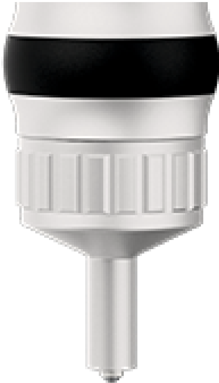
Equotip UCI 3-in-1