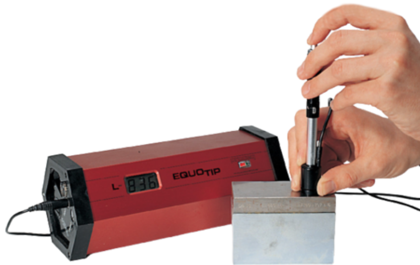
The original EQUOTip