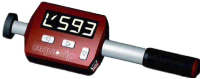
Piccolo & Bambino