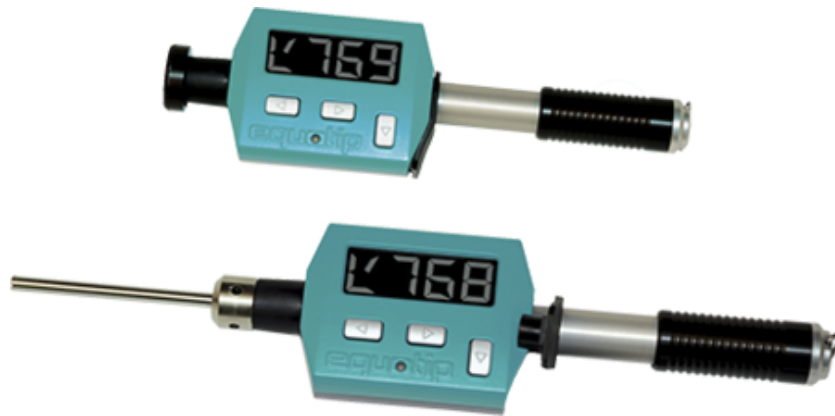
Piccolo 2 & Bambino 2