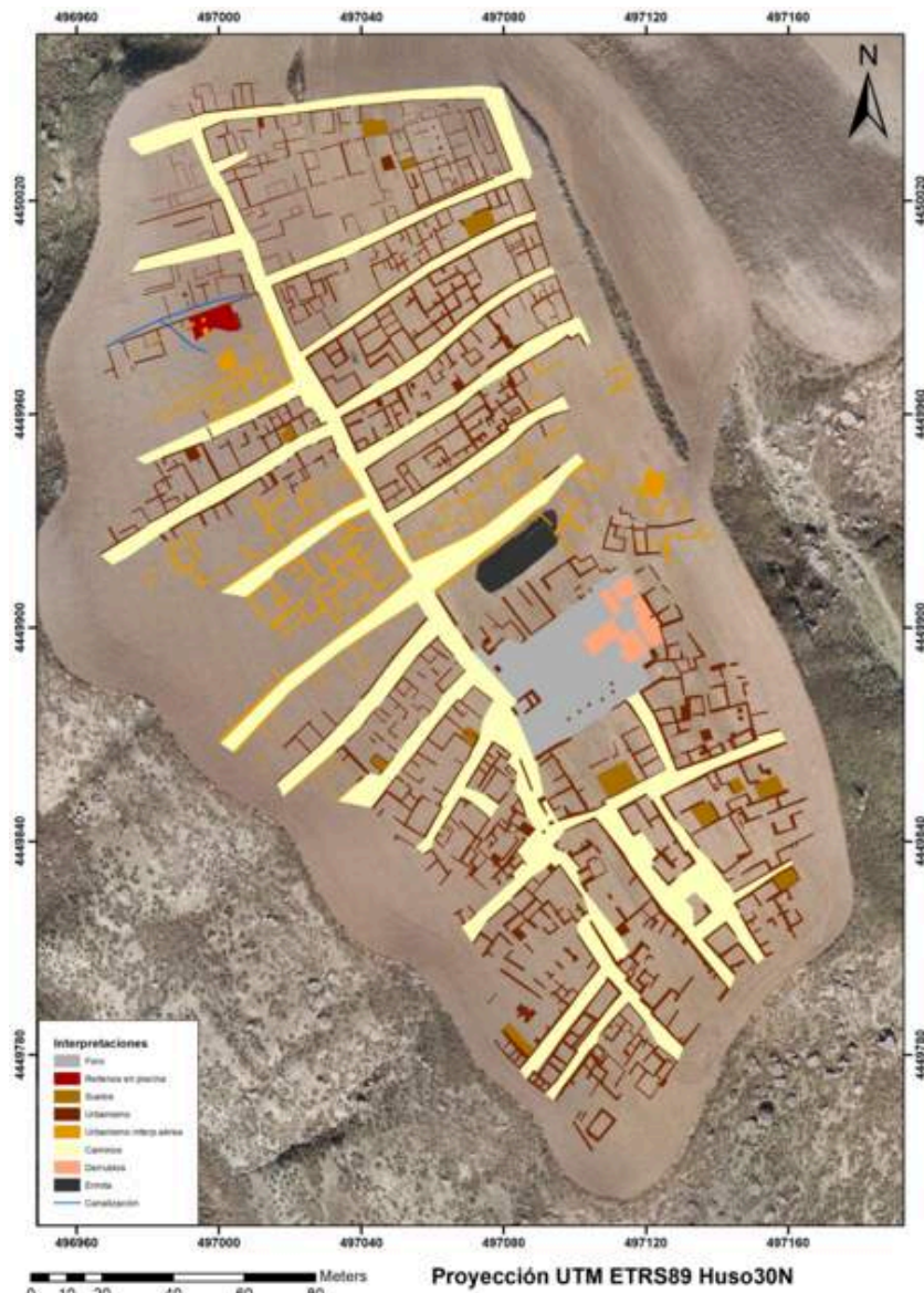
Figure 3. Map of interpretations of results on orthophotography (CAI of Archaeometry and Archaeological Analysis of the U. C. M.).

In the rest of the site, areas of building structures and streets are detected with the corresponding anomalies that will make up the amplitudes that mark the red colors of the slices at different depths (figure 2). Countless walls of various types and thicknesses have been detected. Practically horizontal reflections with rectangular morphologies are detected in the slice view of the 3D block. They surely correspond to paved areas or mosaic-type soils that, when presenting a change in medium, cause a reflection peak in the GPR trace (figure 1, sections A and B).